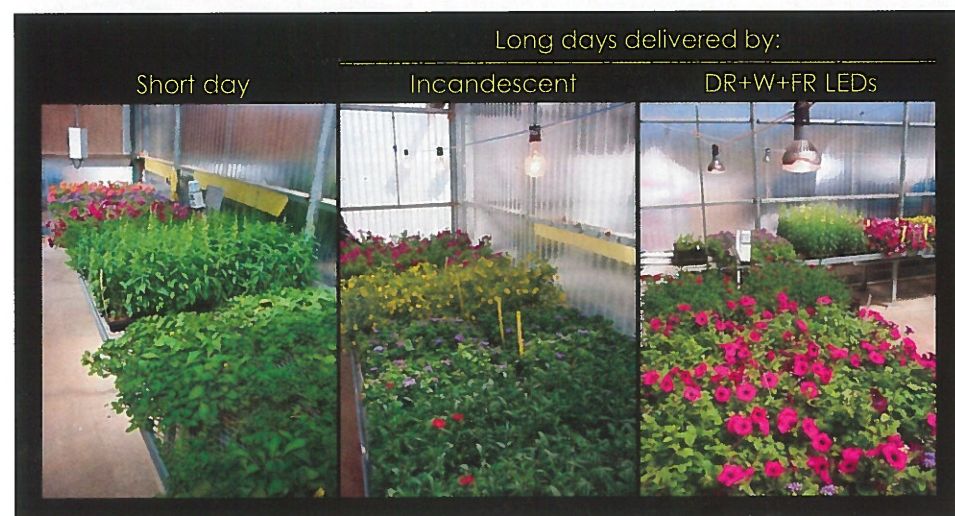
Figure 1. Setup of treatments, including a natural short day and a 4-hour night interruption from incandescent or the Philips deep red + white + far red (DR+W+FR) LEDs, at the Center for Applied Horticulture Research at Altman Plants.

The 14-watt DR+W+FR LED lamp was developed as a commercial replacement for 100 or 150-watt incandescent lamps used for photoperiodic lighting. The DR+W lamp was developed for crops that don't