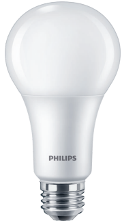
Single Contact Medium Screw A21 (A21) Frosted