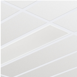
SlimBlend recessed mod. 600