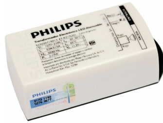
LED Transformer 17 W