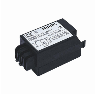
SN 58 T5