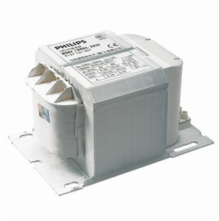
BMH 1800L 202