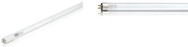
4 pins single ended