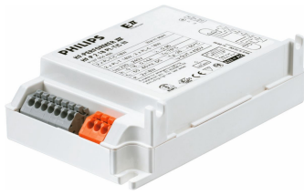
HF-P 118 PL-T/C III 220-240V 50/60Hz