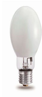
E40 & E39 Coated