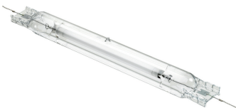
HID-GV III GP-SON