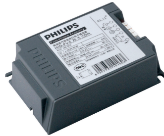
HID-PV E 70 /S CDM 220-240V