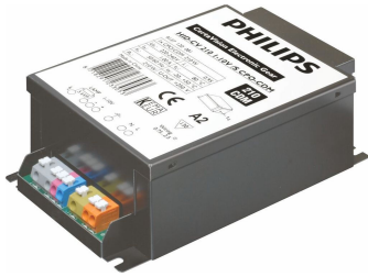
HID-DVE 1-10V 210, HID-PV E 35 /S CDM, HID-PVE 210,