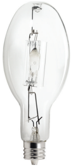
EX39, ED-37, Clear