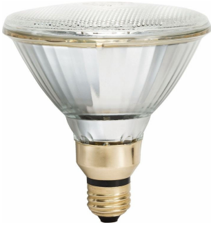
CDM PAR38 Medium Base