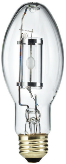
E26, ED-17P, CL, Elite, 50W /940