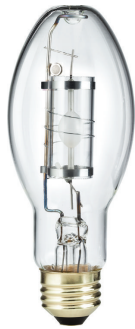
E26, ED-17P, CL, Elite, 70-100W /940