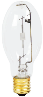
E39, ED-28, Clear