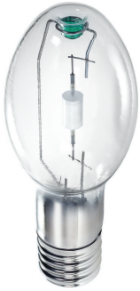
150W, E39/EX39, ED-23 1/2, Clear