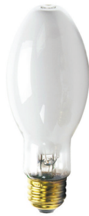
BD17 Medium Coated