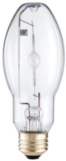
BD17, Med, CL, Elite