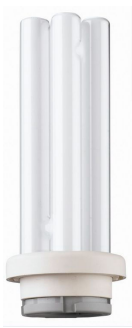
14W, GR14q-1, 4P