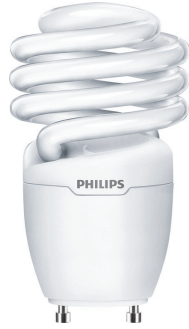
18 W, 23 W GU24