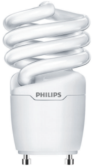
13 W GU24