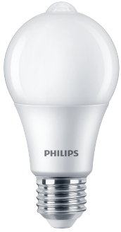
E27 A 60mm Frosted