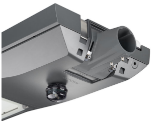
SunStay Pro _ Side Entry