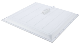
SmartBright Panel RC055