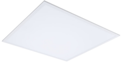
SmartBright Panel RC055