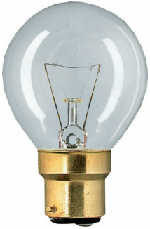
LPPR ILUSBSTD B22 P45 CL