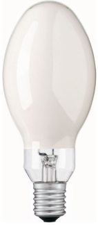
LPPR HPL 0002