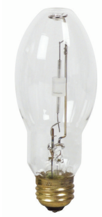
LPPR D-MHC-LW ED17 CL