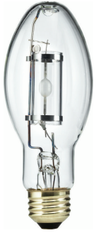
LPPR D-MHC-P 0015