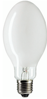
LPPR SON-H E27