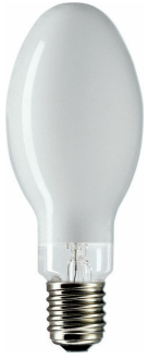
LPPR SON-H E40