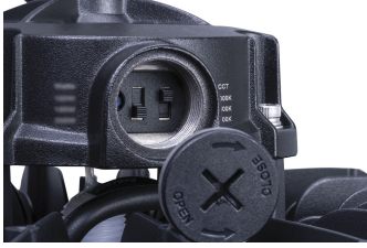
BY240P G2 Selector