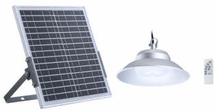
SmartBright Solar Lowbay