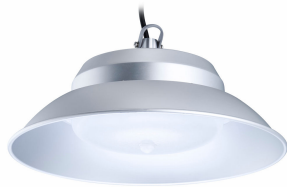
SmartBright Solar Lowbay