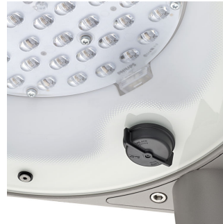
UrbanGlow LED gen3 bottom socket