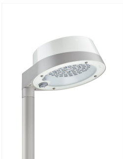
UrbanGlow LED gen3 white product photo