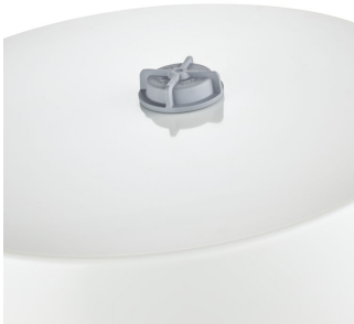
Urbanglow LED gen3 detail photo SRT