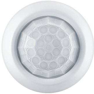
LEDForce HB Accessory