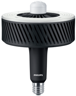
LEDTForce HPI Others E40 sensor