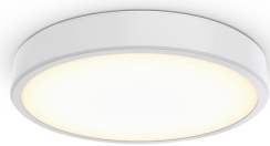
Essential Surface RTP