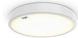
Essential Surface RTP