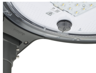
TownTune ASY BDP265