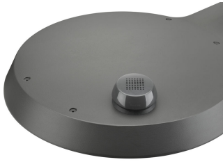
TownTune ASY BDP265