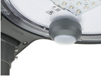
TownTune ASY BDP265