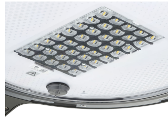
TownTune ASY BDP265