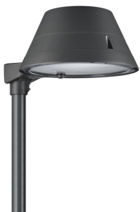
BBDP267, TownTune Asymmetric with decorative top cone and clear decorative ring