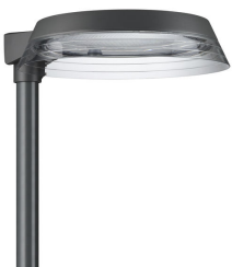
BDP266, TownTune asymmetric with decorative ring