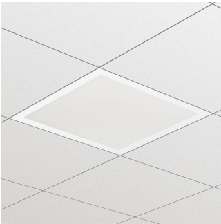
SlimBlend SR-RC400B CPC T