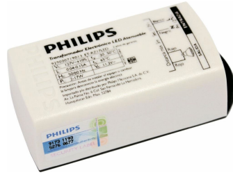
ET-E 10 W LED 220-240V