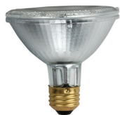
E26, PAR30S, Flood