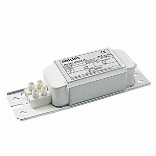
BPL 26W 220V B2 SC