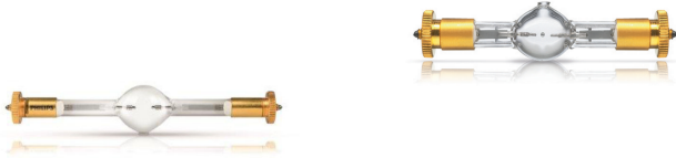
MSR GOLD 1510 SA/1 DE