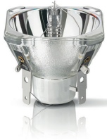
MSD Platinum 2 R