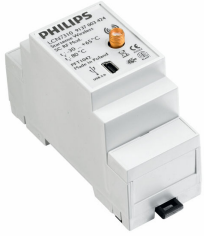
LCN7310/00 Starsense Wireless SC RF mod.