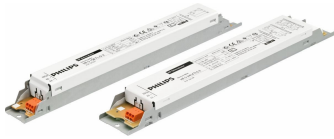
HF-S 118, 136 & 158 TL-D II, HF-S 3/414, 3/424 TL5 II