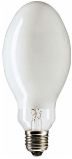
SON APIA Plus Xtra, E27