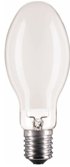
SON APIA Plus Xtra, E40