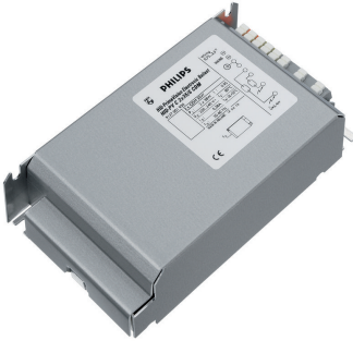
HID-PV C 2x35 /S CDM 220-240V 50/60Hz