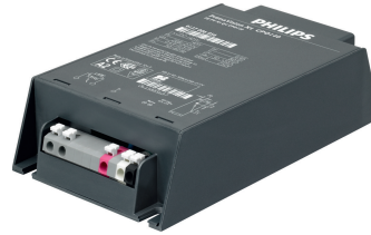
HID-PV Xt 140 CPO Q