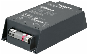
HID-PV Xt 45 & 60 CPO Q