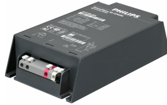
HID-PV Xt 90 CPO Q