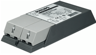
HID-PV E 35 /I CDM 220-240V