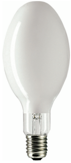
HPI Plus, E40