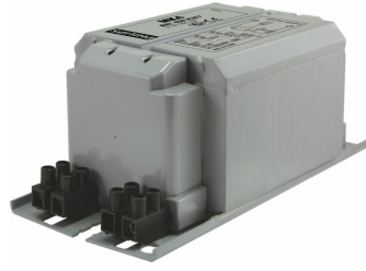
BHL 400 K307-A2 230/240V 50Hz BC2-160