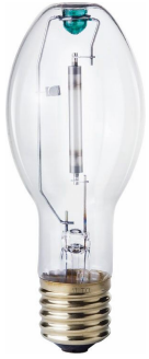
E39, ED-23 1/2, Clear